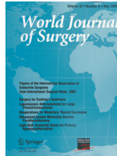
The World Journal of Surgery

As a member of the ISS/SIC, you are entitled to full-text online access to World Journal of Surgery as well as other selected journals published by Springer. Please be advised that the username and password you have used to access World Journal of Surgery on Springer-Link has expired on April 30, 2008. You should in the meantime have received information from Springer Verlag to continue your online access uninterrupted. To access this secured content, you need to have an individual account registered in SpringerLink. The Administrative Office will be happy to inform you of the exact procedure and your token identification. Please contact surgery@iss-sic.ch .