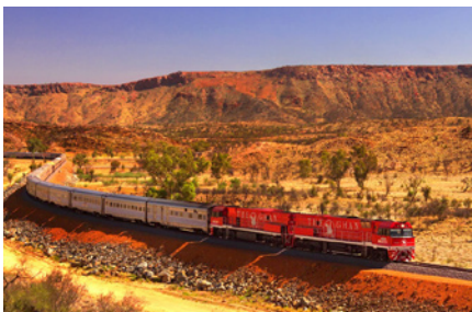
◀ The Ghan, which travels from Adelaide to Darwin and takes 2 days for the one way trip. Flying time 4 hours