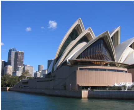
▲ Sydney, New South Wales is 1200 km by road from Adelaide or a 2 hours flight

In addition, the Executive Committee of ISW 2009 has tried to minimize the number of evening affairs to encourage a more social interaction with the many attractions Adelaide has to offer; there will be a brief reception on Sunday night with drinks and finger food, the always popular but optional local event attraction, “Outback Night” will be held Monday evening, most affiliated societies hold their dinners Tuesday evening, and Wednesday and Thursday evenings are free.