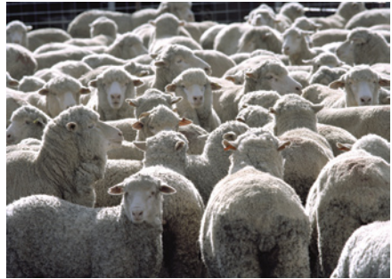
A flock of sheep