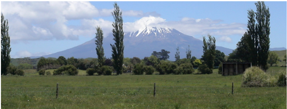
Mt Egmont, North Island, New Zealand