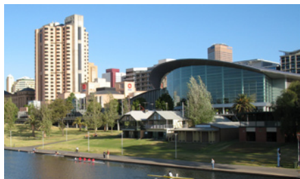
Adelaide Convention Center and the headquarters hotel Hyatt Regency.

Deadlines: ISS/SIC early bird: January 31, 2009 General: April 30, 2009