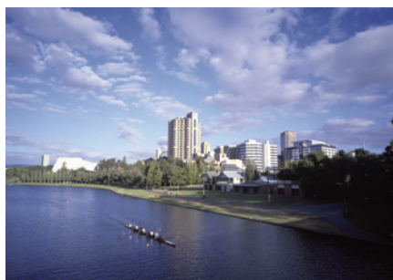
Adelaide, Australia home to ISW 2009 from September 6th to 10th.

ISW 2009 in Adelaide is approaching rapidly and will prove to be an absolutely outstanding, multidisciplinary program. Considerable work has focused on increasing the breadth of the program by hosting joint sessions with several national groups from Australia, particularly the Royal Australasian College of Surgeons (RACS), New Zealand Association of General Surgeons (NZAGS) and General Surgeons Australia (GSA) with the latter holding their annual meeting during ISW 2009 in Adelaide. ISS/SIC is excited about this cooperation, because not only will such interaction broaden the depth of the program offered, but it will help to highlight Australian and New Zealand surgery and its challenges from a more parochial viewpoint.