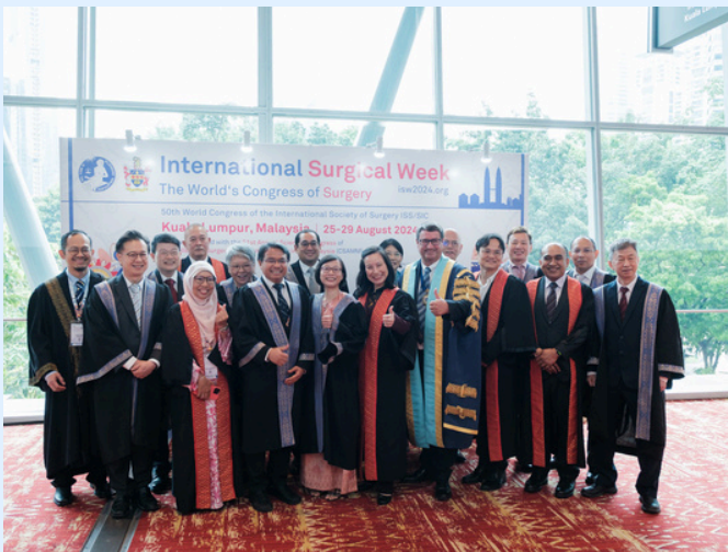
CSAMM Council Members & Guests

ISW 2021 was originally planned to be held in Kuala Lumpur, Malaysia, but was postponed due to the COVID-19 pandemic. Despite the challenges, the ISS/SIC Council remained committed to hosting the congress in Kuala Lumpur, standing by our Malaysian partners, the College of Surgeons of Academy of Medicine of Malaysia (CSAMM).