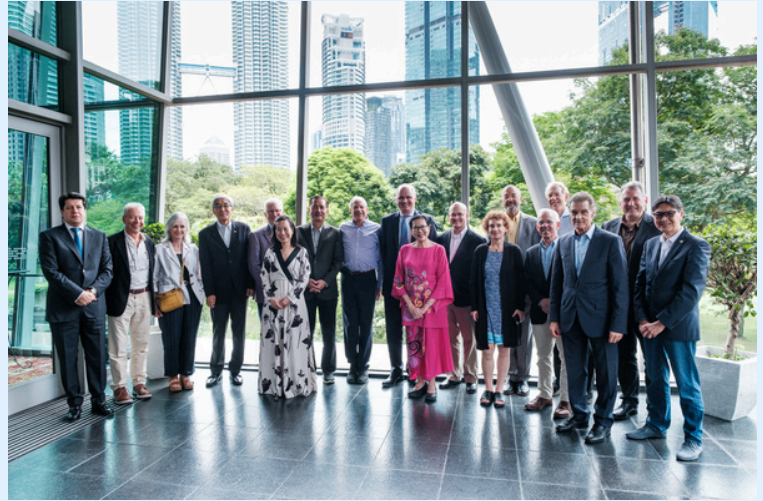
ISS/SIC Council Members 2022 - 2024 & Guests

The mission of International Surgical Week ISW 2024 in Kuala Lumpur, Malaysia, aligns with the vision of the International Society of Surgery ISS/SIC and its integrated societies to advance global surgical standards by fostering collaboration, promoting cutting-edge research, and sharing innovative practices that enhance patient care and professional development across diverse healthcare settings.