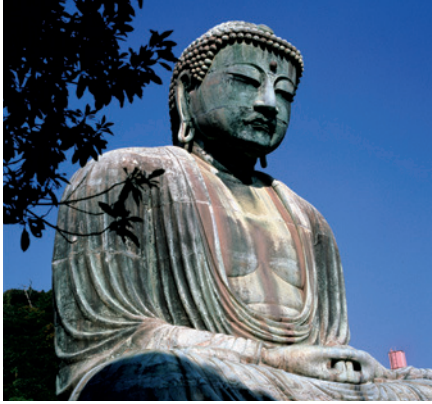
Great Buddha

Although there are Chinatowns in Nagasaki and Kobe, the most famous Chinatown in Japan is in Yokohama, which is also one of the most celebrated landmarks in the Minato Mirai area. Once you enter the Chinatown, you will find yourselves surrounded by totally exotic atmosphere with slightest hint of Japanese color. There are many restaurants standing along the streets that nourish the eyes and the stomach of every pedestrian making them feel content and fulfilled.