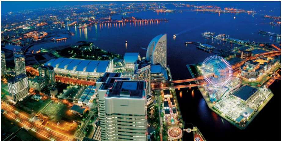
Night view on Minatomirai

The Minato Mirai area is also a great place for shopping with large modern shopping malls reflecting the latest Japanese trends.