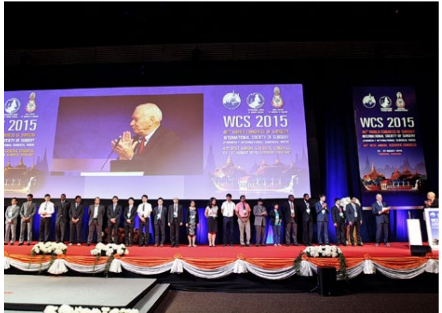
Awarding of Travel Scholars WCS 2015 (ISS-Foundation, IAES, BSI, US Chapter, Australia Chapter and Japan Chapter)