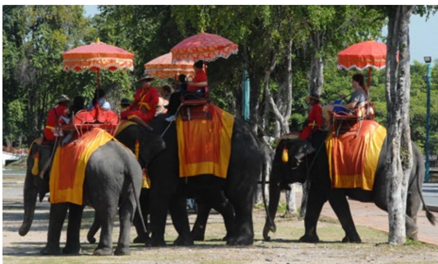
Elephant Riding at Ayutthaya, the ancient capital of Thailand