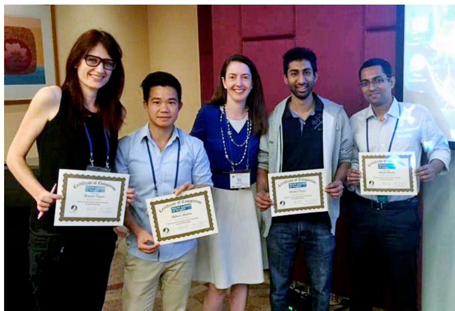
Writer's Workshop Participants proudly present their Diploma