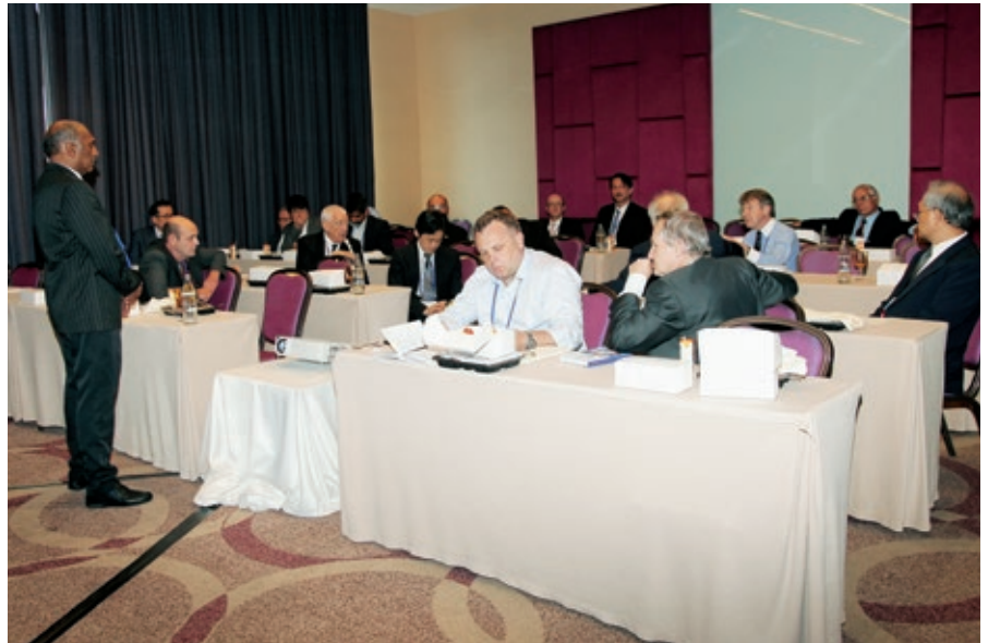
WCS 2017 Program Committee Meeting in Bangkok

Buenos Aires is the capital of Argentina with a deep European heritage, visible both in its inhabitants and in the way of life. In addition to Tango, Argentina is home to the best beef in the world (since cattle is grass fed) and excellent Malbec grapes, whose quality rivals blends from any other part of the world.