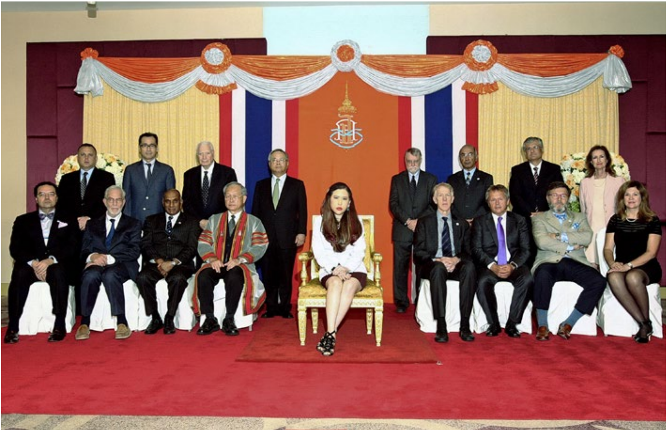
HRH Princess Chulabhorn Walailak with ISS/SIC Executive Committee Members

Member Societies (formerly Integrated Societies) and the Partner Societies cover almost all the areas of surgery.