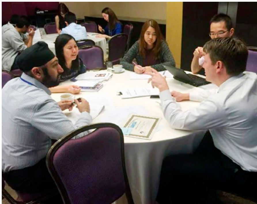
Writer's Workshop at WCS 2015 in progress

The highlight of the meeting was the Writer’s Workshop, held in conjunction with the Career Development Course. At the Writer’s Workshop, 8 faculty members worked with 40 students to provide individuals guidance in abstract and manuscript writing, as well as a primer in writing