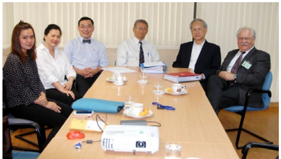
Final accounting meeting at RCST-Offices on December 2 in Bangkok.