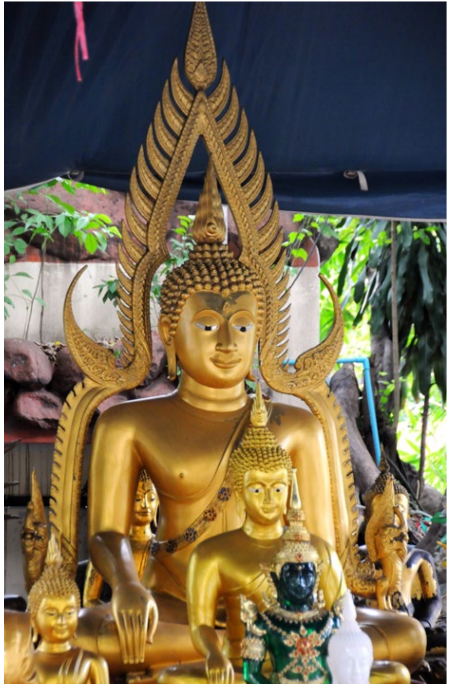
Buddha statues Thailand

The International Society of Surgery (ISS/SIC) was established in 1902, and is considered today one of the oldest and most prestigious international surgical societies. The ISS/SIC functioned as a solo organization for 77 years, but subsequently other international associations joined the ISS/SIC as Integrated Societies. The International Association of Endocrine Surgeons (IAES) was the first association which was founded in 1979 during the San Francisco meeting. Eventually 5 more international associations joined the ISS/SIC: the International Association for Surgery of Trauma and Surgical Intensive Care (IATSIC) in 1989, the International Association for Surgical Metabolism and Nutrition (IASMEN) in 1993, the Breast Surgery International (BSI) in 1999, the International Society for Digestive Surgery (ISDS) in 2009, and the Alliance for Surgery and Anesthesia Presence (ASAP) in 2013. Other Associations such as FELAC, WOFAPS, ISBI contribute as Partner Societies (formerly Participating Societies). Today, the ISS/SIC with its 6 Collective