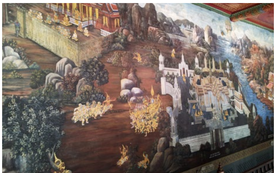
Wall Painting at Wat Phra Kaeo, Bangkok