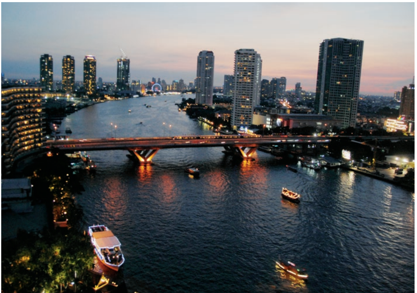
Sunset over Chao Phraya River in Bangkok