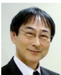
Seigo Kitano, Japan Councilor 2015–2019

The following two members of the ISS/SIC Executive Committee have been proposed for election and were approved by the General Assembly 2015. We warmly welcome them as committee members.