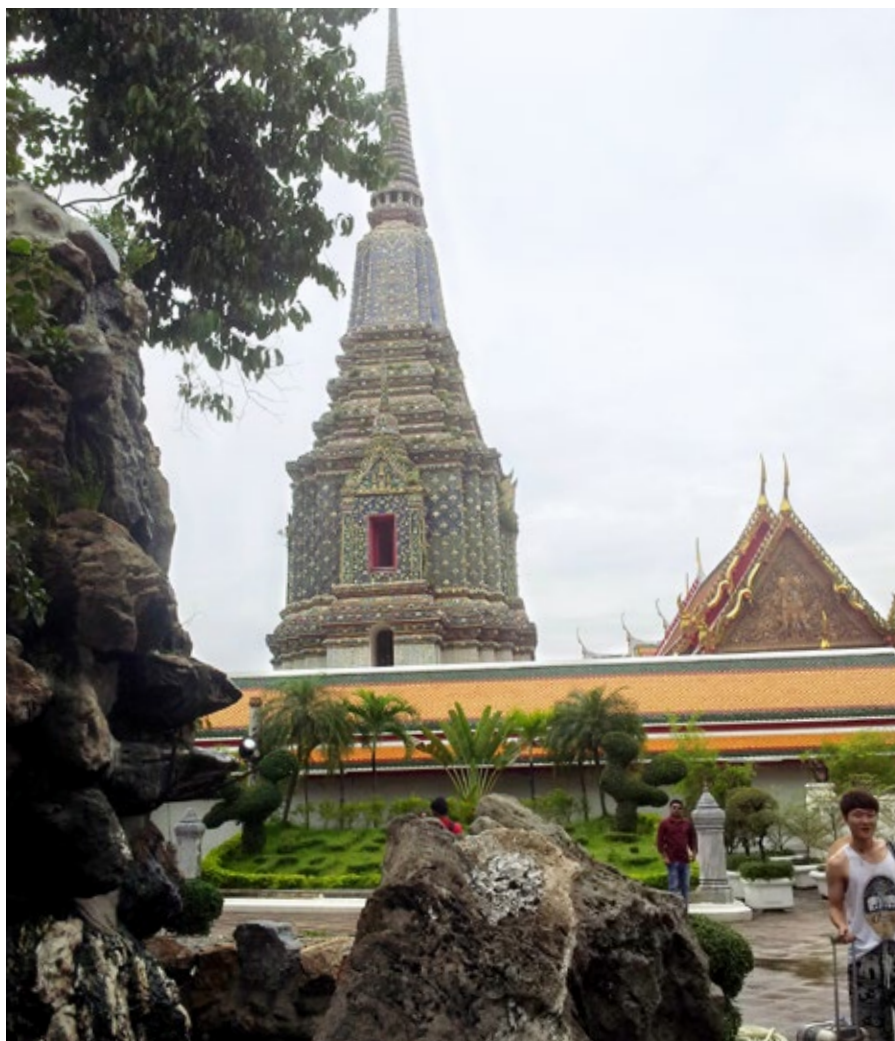
Pagoda at Wat Pho, Bangkok