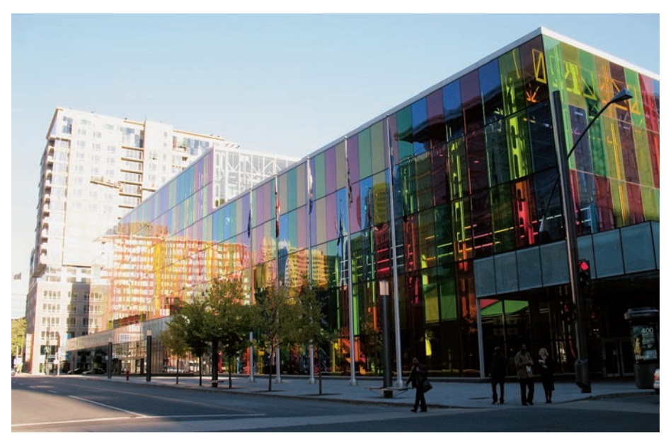
The Montréal Convention Centre

The cost of living is more affordable in Canada than e.g. in the nearby US. Why not planning your family vacations in Québec or other areas of Canada before or after the congress? Find out about 1–3 days pre- or post-congresstours on our webpage www.isw2007.org or arrange for a longer stay. The accompanying persons program and the social events are presented on the same website. Under the item "accommodation" you find a selection of hotels of different categories. Have a look now.