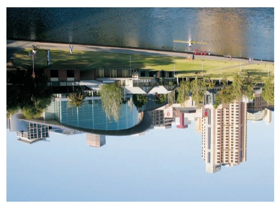
The Adelaide Convention Centre Down Under

of the Local Organizing Committee. The Australian Chapter has been very active and has already formed the Local Organizing Committee which will also be supported by New Zealand surgeons.