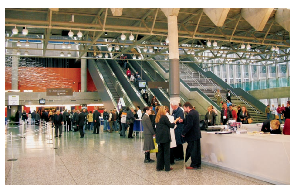
Inside Montréal Convention Centre