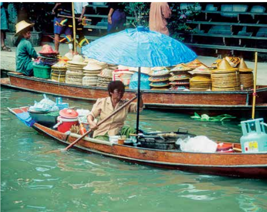
Floating Market Bangkok

Wednesday, August 26: Thai Night Dinner at Sampran Riverside: Sampran Riverside (formerly known as Rose