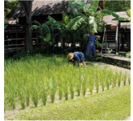
Rice planting show at Sampran

Garden Riverside) is a family-run property close to Bangkok, where visitors can experience authentic Thai way of life and learn about our local wisdom. For decades it has been considered one of Bangkok's favorite attractions because of the obvious dedication to preserving Thailand's natural and cultural heritage by engaging with the local community. Sampran Riverside provides a perfect city break for a one day trip near Bangkok or an overnight trip all year round.