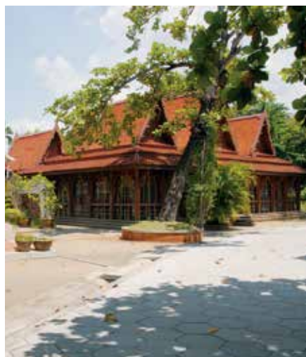
House at Sampran