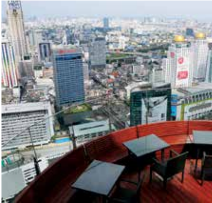
Bangkok from the top of Centara Hotel