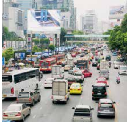
Busy street in Bangkok