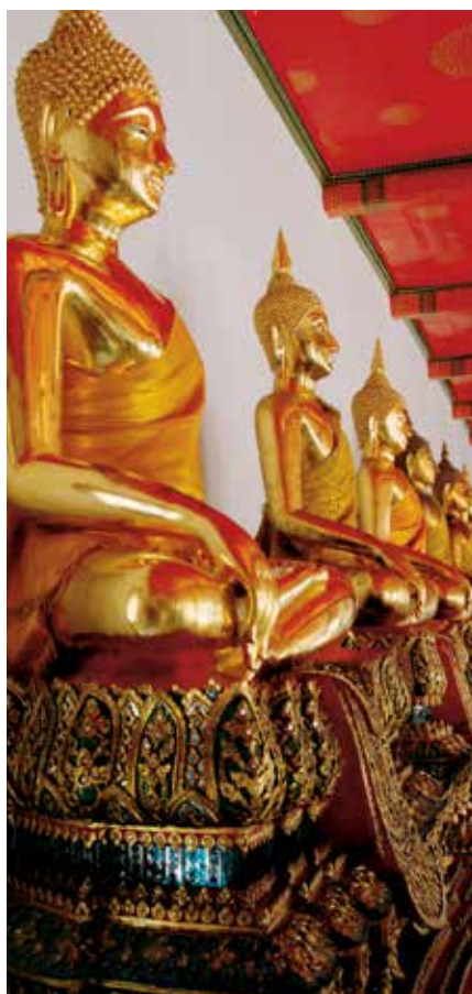
Line of Golden Buddha