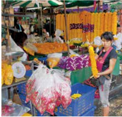
Flower-Market in Bangkok