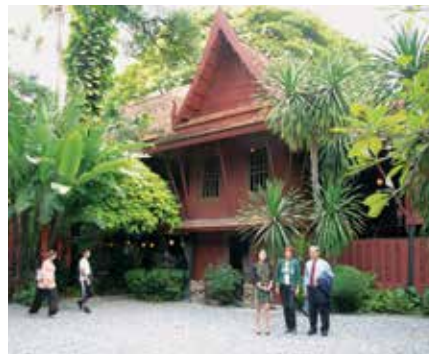
Jim Tompson House – ISDS/IASMEN Dinner