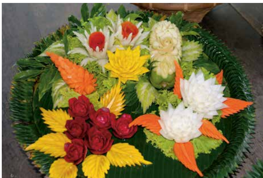
Art in Fruit Carving at Sampran