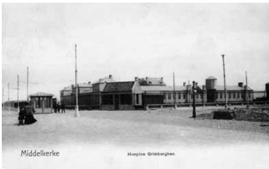
Fig.4. Post card of the 'Hôpital maritime Roger de Grimberghes' in Middelkerke near Ostend.