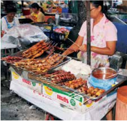
Street-meat-food Stall in Bangkok