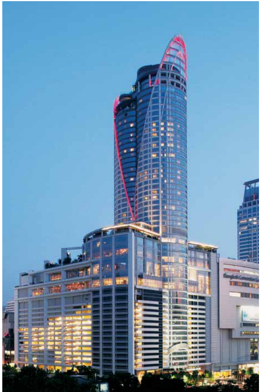
Centara Grand Hotel with Convention Centre at Central World, Bangkok

Newest Shopping Malls: Bangkok has more than enough shopping malls to suit