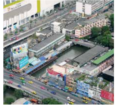
River Boat on Khlong in Bangkok

all kinds of lifestyles and budgets. Our top and newest shopping malls offer the best shopping experiences, in terms of diversity of products, accessible location in downtown areas and overall shopping satisfaction. Whether you are looking for the most upscale, the trendiest, the funkier, or the most specialized, you will find them among these new and also old shopping malls in Bangkok.