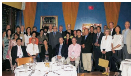
BSI Dinner at Montreal