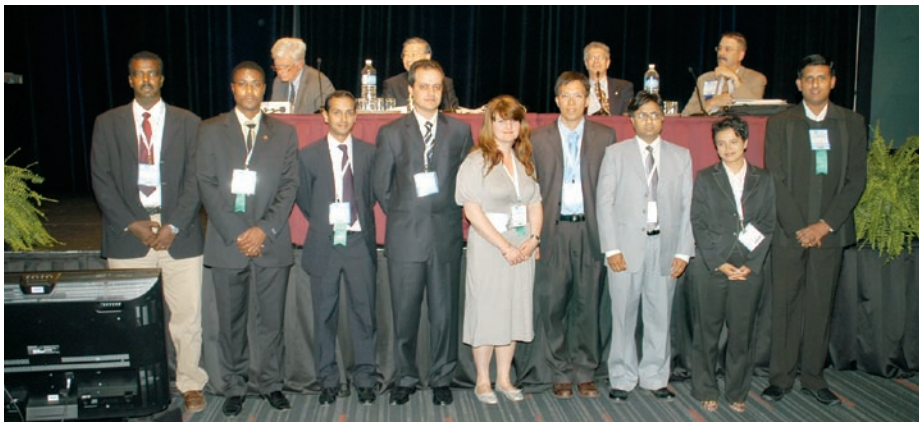
ISS-F Travel Scholars ISW 2007