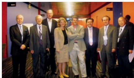
Breast CA east-west panelists