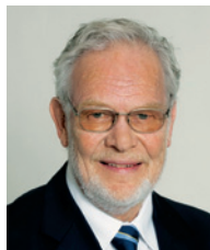
President elect 2009 to 2011 Göran Akerström, Sweden

The General Assembly at ISW 2009 has confirmed the following new Executive Committee Members: