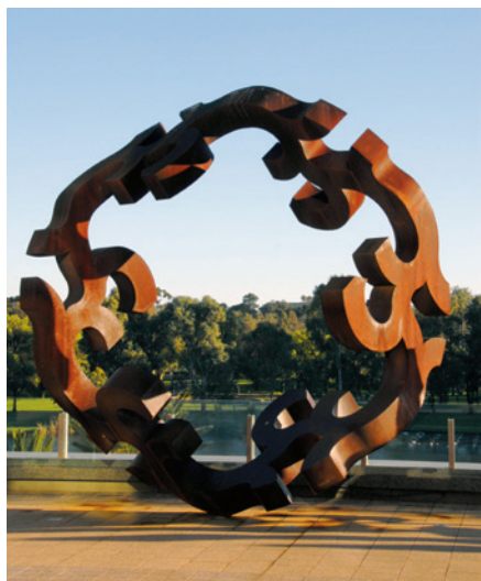
Sculpture at Adelaide Convention Center