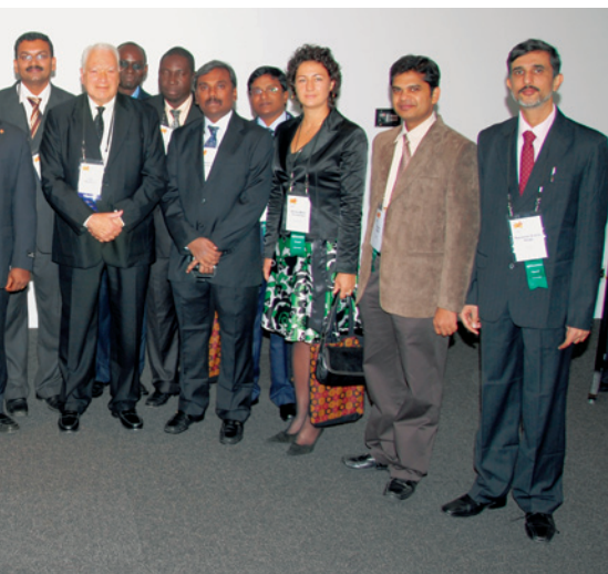
ISS-Foundation Travel Scholars at ISW 2009